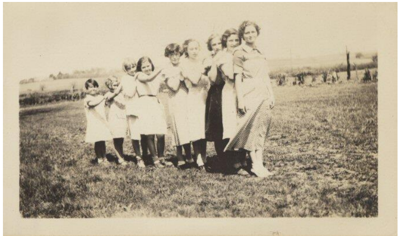
Students in one-room schools could range from first through eighth grade. These girls attended Lanesfield School in the mid-1930s.

The image of the solitary one-room country school stirs feelings of whimsy and nostalgia for many people. It is a symbol of the pioneer spirit, of childhood mischief, and of moral lessons. For rural communities, the one-room schoolhouse was often the community center where families met to celebrate holidays, hold elections, and host pie suppers or ice cream socials. At one time, Johnson County had approximately one hundred one-room schools. Many of those buildings no longer exist, through closures or demolition. Lanesfield School is one of the few remaining one-room schools in Johnson County.